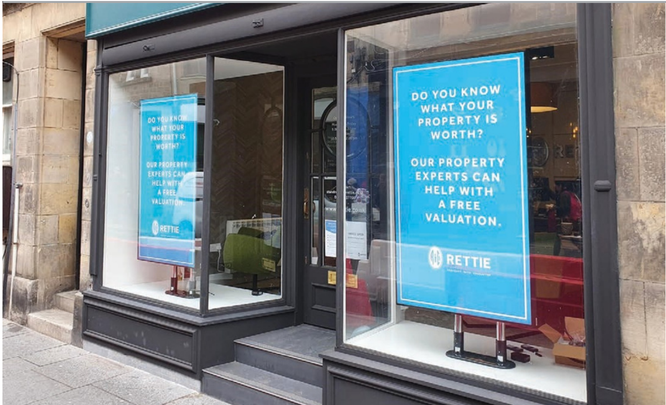
Designed for outward-facing window displays in direct sunlight